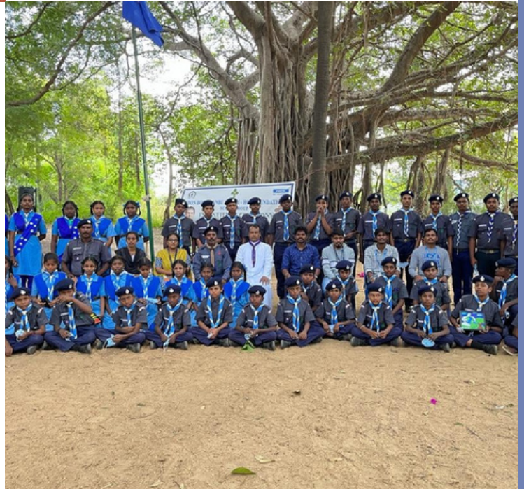
ANNA ADMINISTRATIVE STAFF COLLEGE CHENNAI - 600 0 TRAINING PROGRAMME ON CHILD PROTECTION INFORMATION MANAGEMENT AND MONITORING SYSTEM BATCH-4 28-03-2022